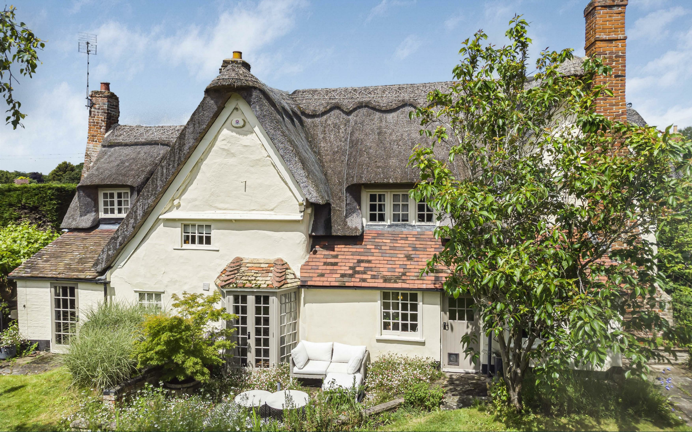
The Old Forge, High Street, Great Abington, CB21 6AE